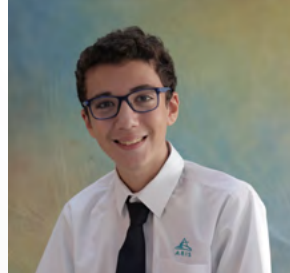
Del Monaco Edoardo