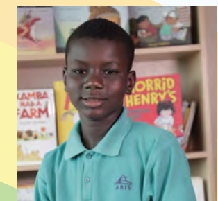
A la alvala va la la la va a a la