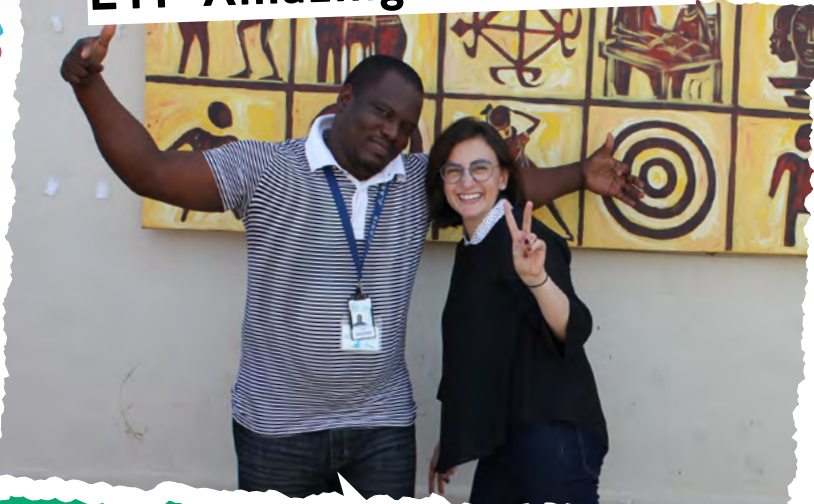
The INCREDIBLE IT Department