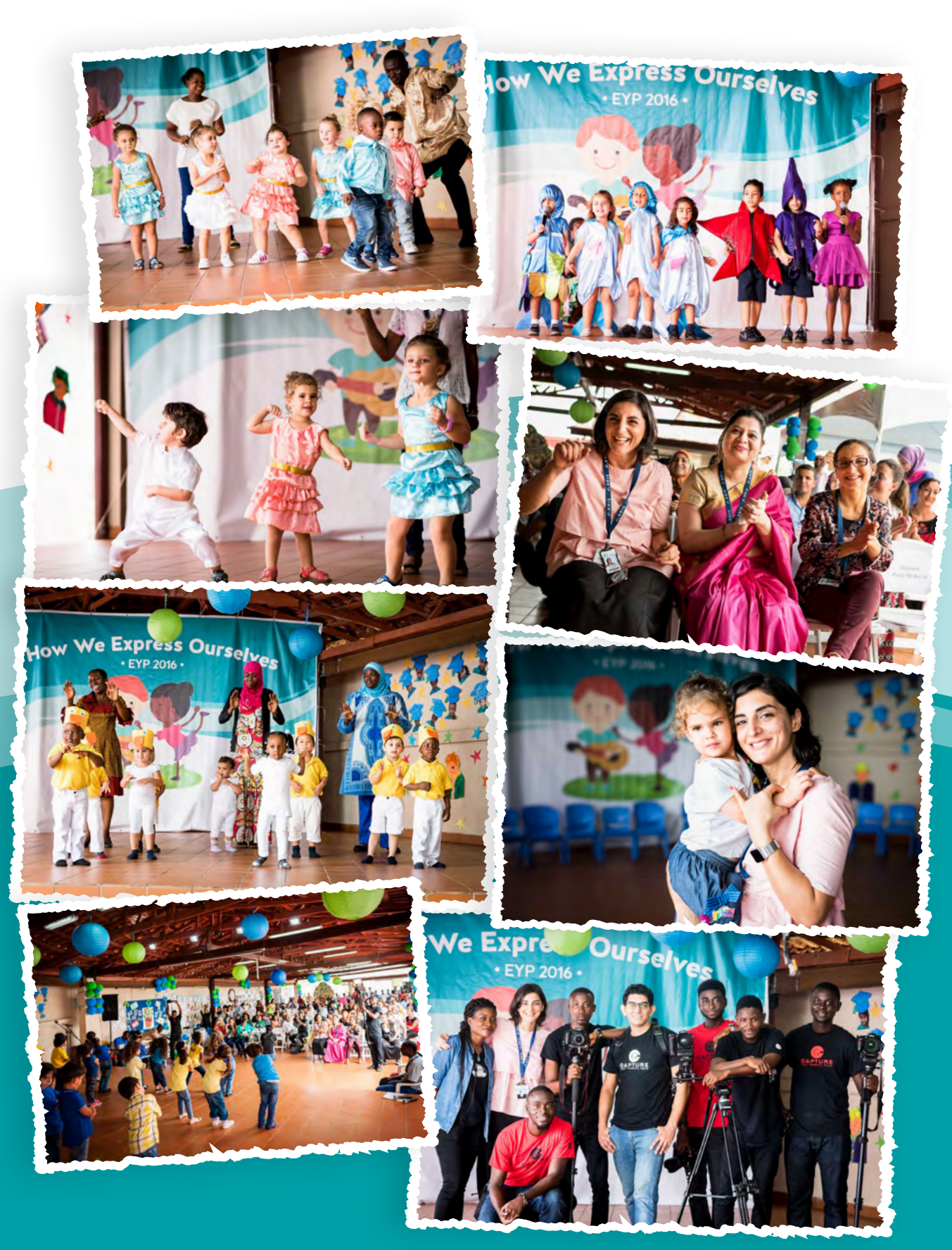
Playgroup | Nursery | Reception