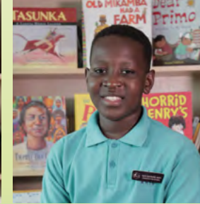
Alfa Alfa Alfayine