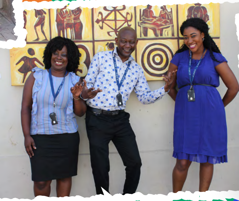
The Euphoric EAL Department